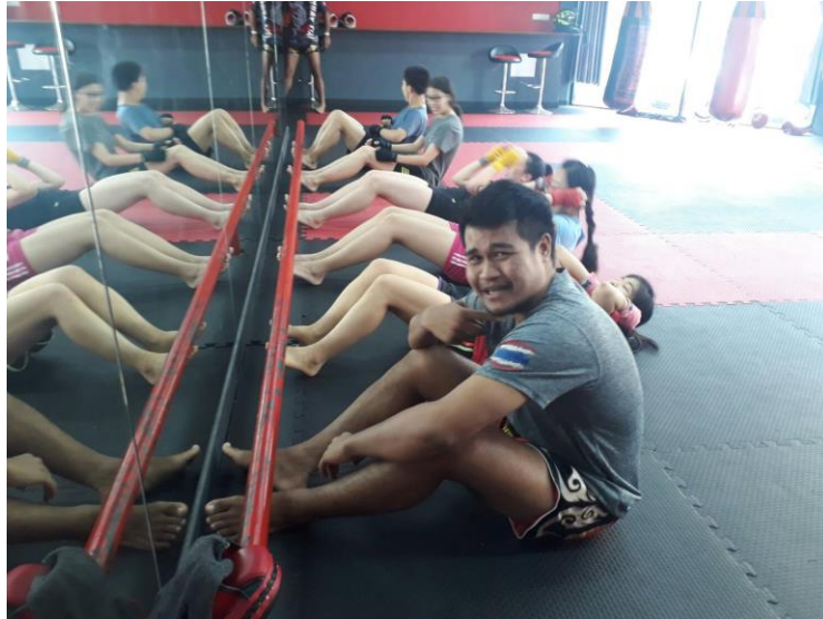
Learning boxing at Archasiam Boxing Gym