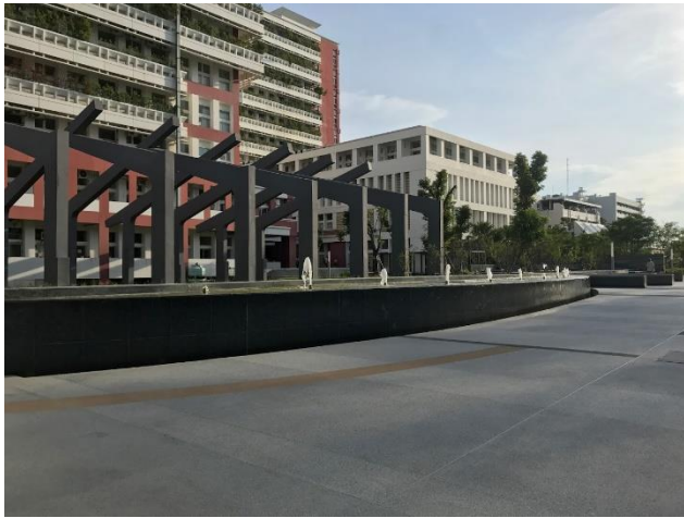
KMUTT, Bangmod Campus

My internship started at the Data-Science and Engineering Lab (D-Lab) at School of Information technology (SIT), KMUTT. My major project here was using machine learning techniques to help classify eye images based on their level of severity of a disease, Diabetic Retinopathy. In D-Lab, there are many other graduate and PhD students working constantly. By working, talking, and helping each other, we made many friends in D-Lab. It is a very productive environment for working and a very friendly place for socialization, since everyone is nice, smart, and fun to talk to.