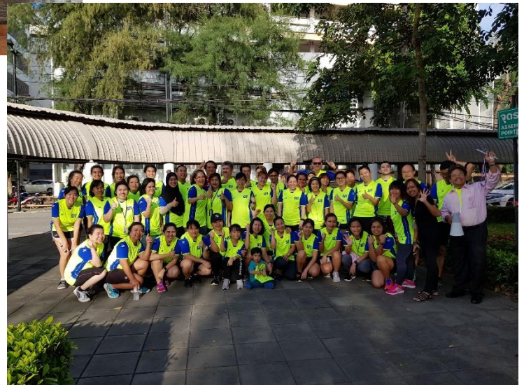
Second mini-marathon (2.5 km) around the running track of Bangmod Campus, KMUTT