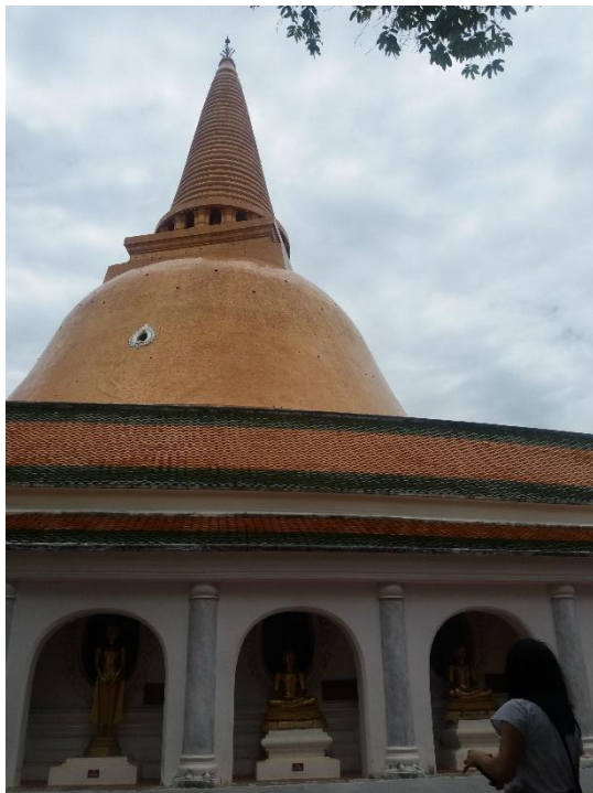
A Temple close to the Mettapracharak Hospital