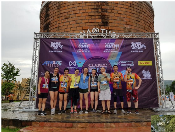
First mini-marathon (5 kilometer), still proud that we all finished it!