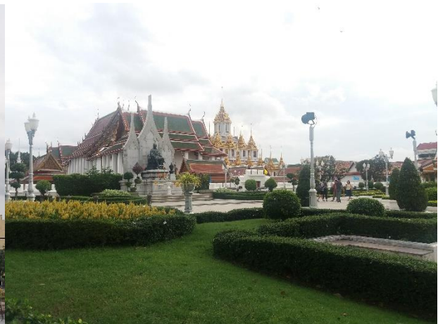
The Victory Monument (on the left) and temple (on the right) close to Khao San Road, Bangkok