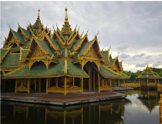
The Ancient City