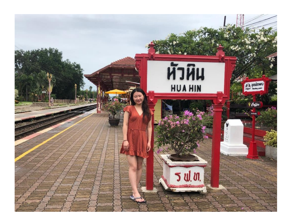
My Summer Internship at KMUTT