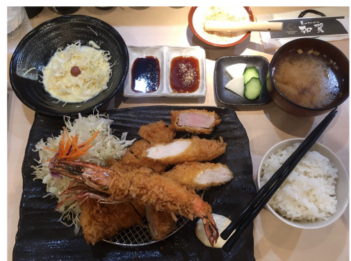
All set tonkatsu (deep fry meal)