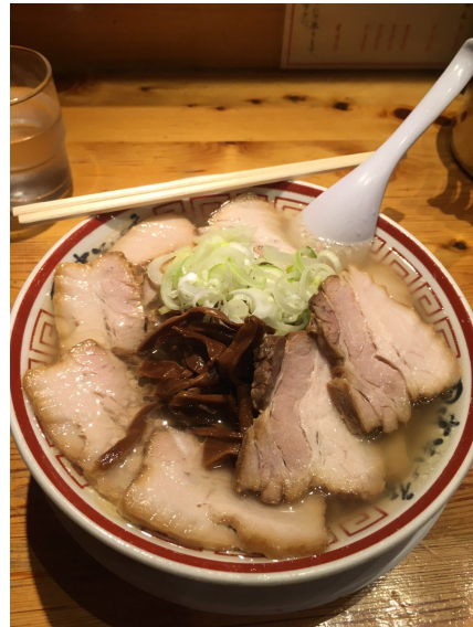
Tender meat ramen