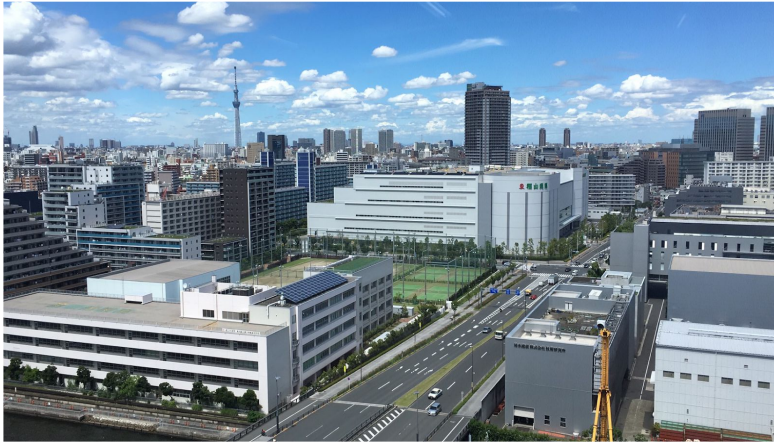
The view from my office window. Very peaceful and relaxed.

Japanese culture is very strict and meticulous. Unlike Thai culture, Japanese always doing their jobs smooth and well so everything you experienced in Japan is kind of beautiful thing. Although there were many passengers in a local train during rush hour, the atmosphere is the train still silence.