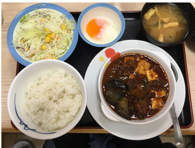
Mapo tofu rice set -- my favorite menu