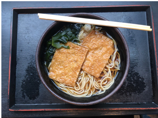
Deep fry tofu ramen

Finally, the Japanese food culture is very amazing. The Japanese restaurant has great service. The food here is very different from Thailand. Most of the Japanese food is made from carbohydrates and served with a side dish like pickles, miso soup, etc. During the meal, I always lift my hand and say "Sumimasen, Omizu kudasai" which means "Excuse me, can I have some water". Then, the staff comes and serves water with a smile. Unfortunately, some Japanese restaurants do not have English menus. Therefore, I must learn some alphabets and kanji like "水" that means "water" and "お酒" which means "sake (alcohol beverage)".