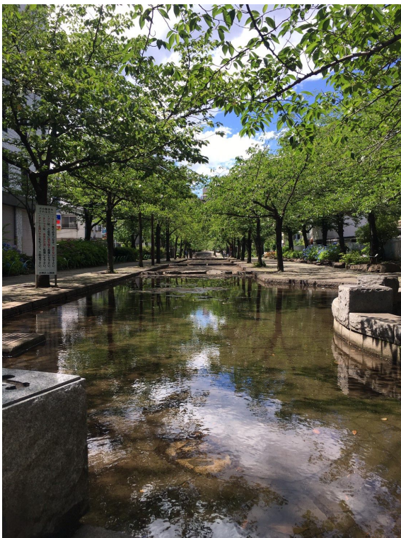
The sightseeing around the suburb is very charming.

Regarding the environment, there is no food stall on the side of the road so the sidewalk is very clean and smooth. Every single corner of the roads always has trees planted on it.