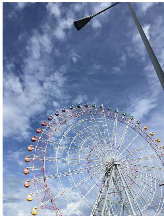
The downtown is very outstanding too.